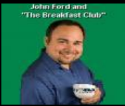
John Ford and "The Breakfast Club"